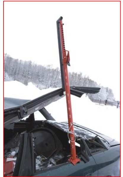
How to use lifting hook